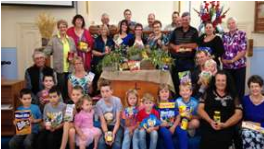
Our Congregation at our Harvest Thanksgiving Service