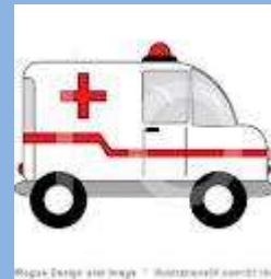
A. Brown Port Wakefield

Someone will be available to answer your call on 0429 671 469