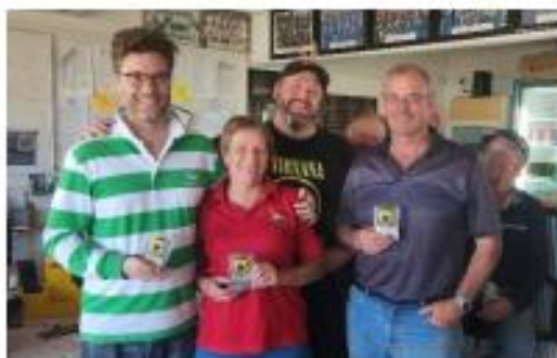
Our 2024 winners - The Balaklava Royals

We would also like to thank to the PW Bowling Club and the committee members who came and helped on and before the day for prepping the greens and managing the bar your continued support for our committee is much appreciated.