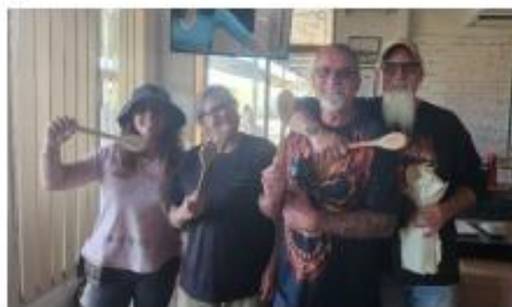
And the 2024 Wooden Spooners -The Gawler Gang